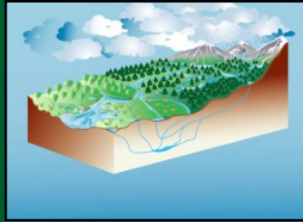
A 3 Dimensional Drawing of a Watershed